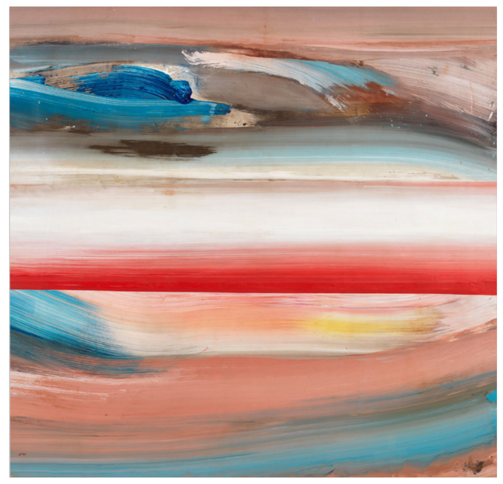
Ed Clark, Untitled, ca. 1996-97. Acrylic on canvas, 286.4 x 303.5 cm.